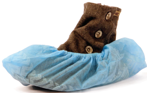
Shoe Cover Dimensions