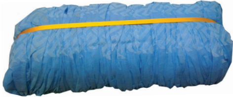
Bundle of Booties

Shoe Cover Refills for: KineticButler Automatic Shoe Cover Dispensers