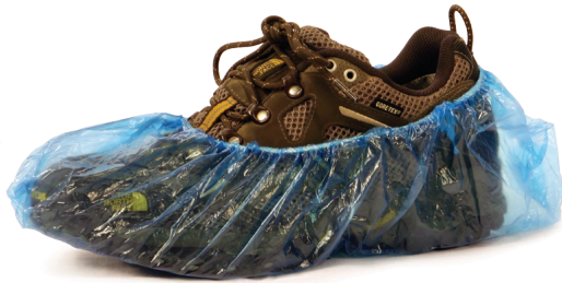
Shoe Cover Dimensions