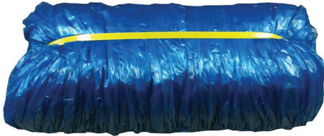
Bundle of Booties

Shoe Cover Refills for: KineticButler Automatic Shoe Cover Dispensers