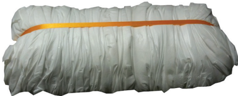
Bundle of Booties

Shoe Cover Refills for: KineticButler Automatic Shoe Cover Dispensers