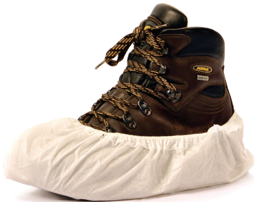
Shoe Cover Dimensions